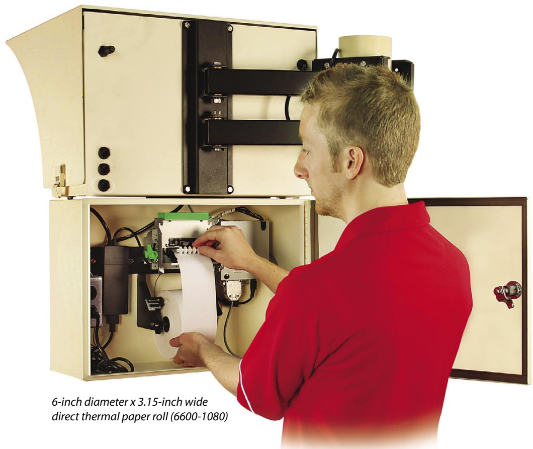
6-inch diameter x 3.15-inch wide direct thermal paper roll (6600-1080)

These unattended weighing terminals allow the driver to remain in their vehicle while weighing which reduces the risk associated with walking across truck scale platforms and traffic lanes. Not only is this a safer method of receiving truck weights, but it also speeds the weighing process for optimal efficiency and reduces overall operating costs.