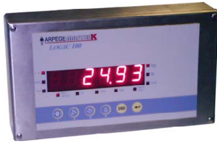
Stainless steel version