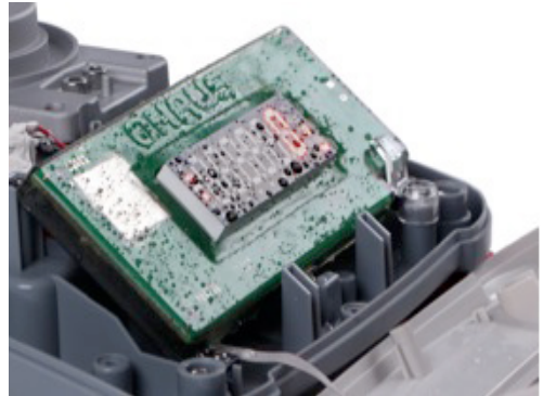
Inside PCBA Silicon Glue Sealing

The flow-thru, water-resistant design allows for safe weighing of liquid components and can be used in harsh or damp environments. Valor 2000's IPX8 full waterproof construction and silicon glue sealing design to its PCBA make it durable in extreme environments and eliminates the risk of water damage. Additionally, cleaning your scale has never been safer and easier, further ensuring the cleanliness of your workstation.